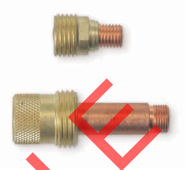
Figure 20 – Gas Lens For A 250A Water-Cooled Torch (Top) And A Gas Lens For A 150A Air-Cooled Torch (Bottom)