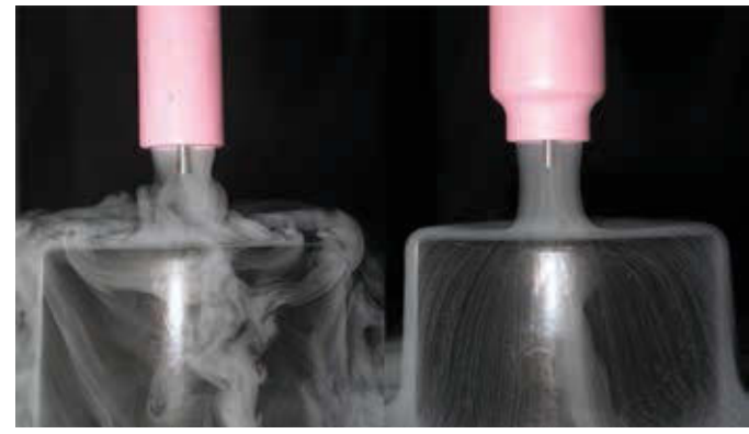
Figure 18 – Erratic Gas Flow On A Collet Body (Left) Smooth Directed Gas Flow Of A Gas Lens (Right)

In GTAW, adequate gas coverage is very important to ensure that the weld pool is adequately protected from atmospheric contamination. Too often, a nozzle that is too small is chosen to produce a "small" weld. The smaller the diameter of the nozzle, the smaller the gas envelope is to adequately shield the weld pool. The discoloration often referred to as "blueing" or "straw color" on stainless steel, for example, is simply an indication of what the surface temperature was when the shielding gas was removed and the base metal became oxidized as it was exposed to the atmosphere (Figure 19). Using a gas lens, for example, helps to ensure adequate coverage of the material and weld pool to minimize any oxidization on the surface (Figure 18).