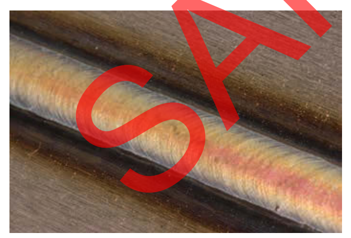
Figure 19 – Coloring Of A Stainless Steel Weld, Note The Coloring Indicates The Temperature Of The Surface When The Inert Shielding Was Removed And Is Essentially A Layer Of Oxidation (This Is An Acceptable Level Of Oxidation)

All connections and hoses can be checked with a soapy water solution to locate gas shielding leaks. Remember, gas connections and hoses downstream from the gas valve have to be checked with the gas flowing – use the purge function on the wire feeder.